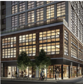
F - 187 Parliament St