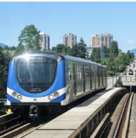
Ontario Relief Line

Buyer and Buyer's Agent To Verify. New Development has been provided to the Buyer for general informational purposes only and as such, Sage Real Estate does not warrant its accuracy nor make any representations or warranties regarding contents of same.