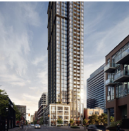
A - 121 George St