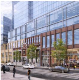
C - 245 Queen St E