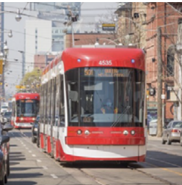
TTC Street Car