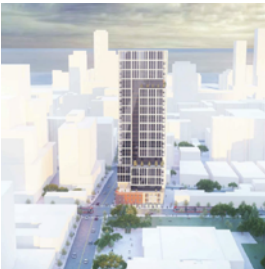
B - 225 Queen St E