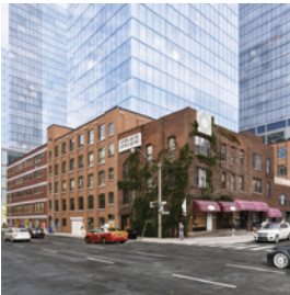
C - 245 Queen St E